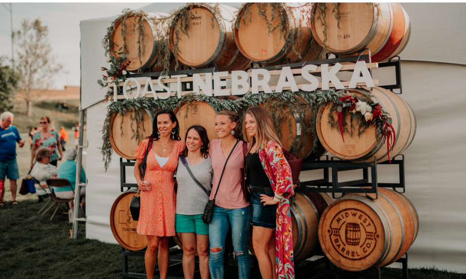
Pictured: Midwest Barrel Co. sponsored backdrop.

Only one headliner sponsorship is available per event.